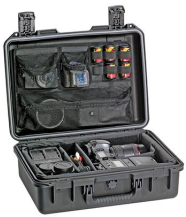
iM26XX-PHOTOPALLET Photography Pallet