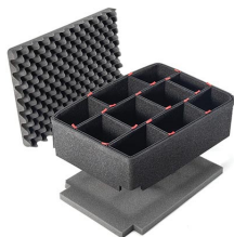
iM2620TPKIT TrekPak Case Divider Kit