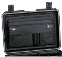
iM26XX-LIDORG Lid Organizer