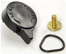
iM-VALVE-M-B Manual Purge Valve