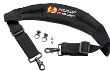
iM-STRAP-S-VER2 Padded Shoulder Strap