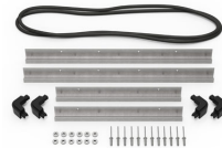
iM2620-BEZEL Base Bezel Kit