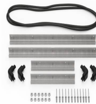
iM2500-BEZEL Base Bezel Kit