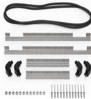
iM2500-BEZEL-LID Lid Bezel Kit