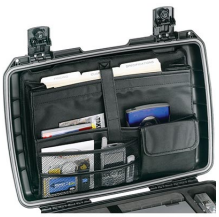
iM2370-UTILITYORG Utility Organizer