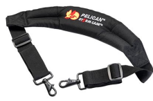
iM2370-STRAP-S Removal Padded Shoulder Strap