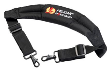
iM2370-STRAP-S Removal Padded Shoulder Strap