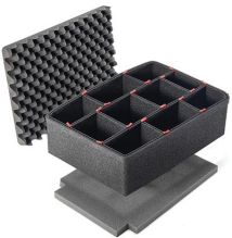
iM2200TPKIT TrekPak Case Divider Kit