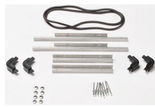
iM2200-BEZEL-LID Lid Bezel Kit