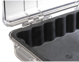
1021 Replacement Case Liner