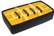
1605AirDS Padded Divider Set