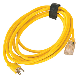
9606 Power Cable