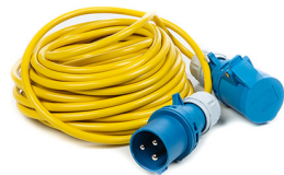
9606E Power Cable

Peli c/ Provença, 388, Planta 7 • Barcelona, Spain 08025 • Phone: +34 934 674 999 info@peli.com • www.peli.com