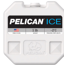
PI-1LB 1lb Ice Pack