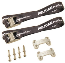
TDKIT Tie Down Kit