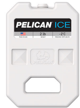
PI-2LB 2lb Ice Pack