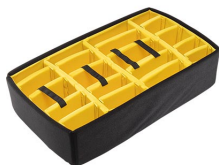
1675 Padded Divider Set