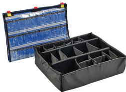
1605EMS EMS Accessory Set (Lid Organizer and Divider Set)