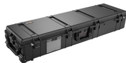
1770NF No Foam