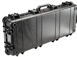
1700NF No Foam