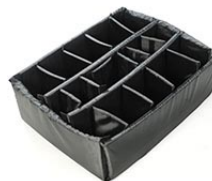
1695 Padded Divider Set