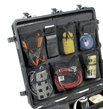
1699 Lid Organizer