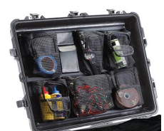
1639 Lid Organizer