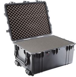
1630WF With Foam