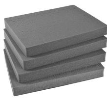
1622 Pick N Pluck™ Sections Only (set of 4)