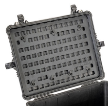
1610MP EZ-Click™ MOLLE Panel