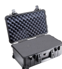
1510WF With Foam