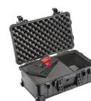
1510TPF TrekPak / Foam Hybrid