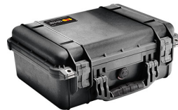
1450NF No Foam