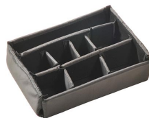
1455 Padded Divider Set