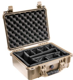
1454 With Padded Dividers