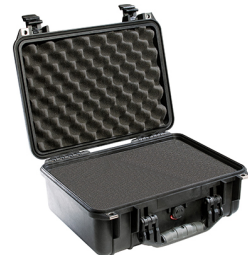
1450WF With Foam