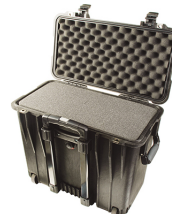
1440WF With Foam