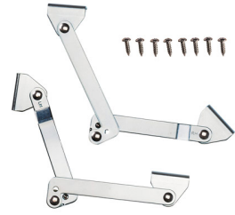
KIT-LIDSTAY-CARGO Cargo Lid Stays