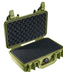
1170WF With Foam