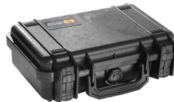
1170NF No Foam