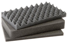
1171 3 pc. Replacement Foam Set