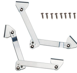
KIT-LIDSTAY-CARGO Cargo Lid Stays