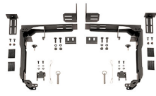
SDDLMT2A Saddle Case Bed Mount Kit for Bedrail Flange Mounting