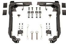
SDDLMT2B Saddle Case Bed Mount Kit for Toyota™ Tacoma™ Truck