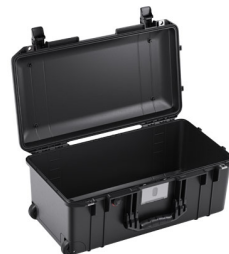
1556NF No Foam