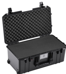
1556WF With Foam