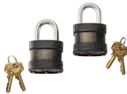
PL2 Padlock (2 pack)