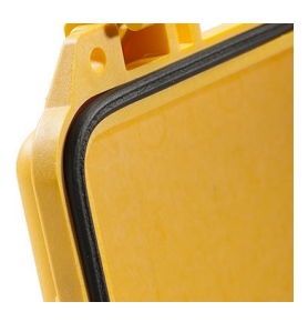
1073 Replacement O-ring