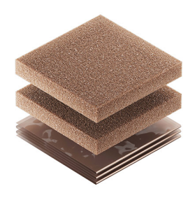
1500CI Corrosion Intercept Kit