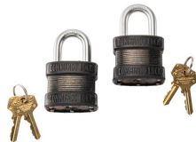
PL2 Padlock (2 pack)