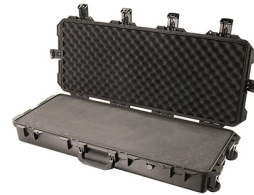
iM3100-X0001 With Foam