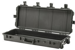
iM3100-X0000 No Foam