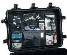
iM3075-UTILITYORG Utility Organizer