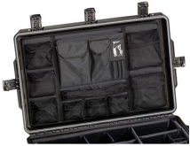
iM29XX-UTILITYORG Utility Organizer