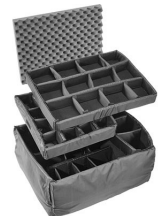
iM2750-DIV Padded Divider Set