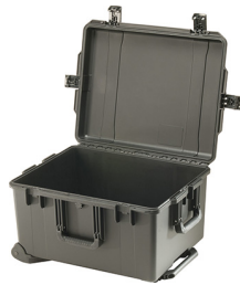
iM2750-X0000 No Foam