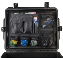
iM27XX-UTILITYORG Utility Organizer