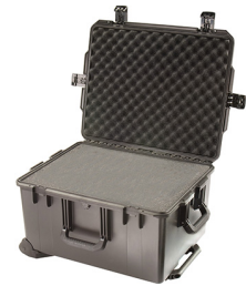
iM2750-X0001 With Foam