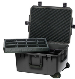
iM2750-X0002 With Padded Dividers