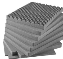
iM2750-FOAM 7 pc. Replacement Foam Set