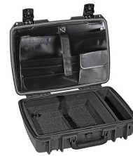
iM2370-X0003 Computer Case Deluxe