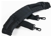
iM2370-STRAP-S Removal Padded Shoulder Strap