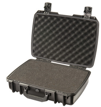
iM2370-X0001 With Foam