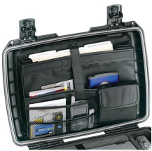
iM2370-UTILITYORG Utility Organizer