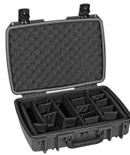
iM2370-X0002 With Padded Dividers