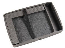
iM2370-COMPTRAY Computer Tray