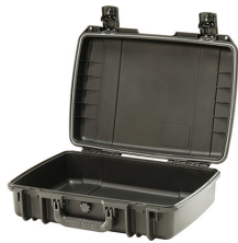
iM2370-X0000 No Foam