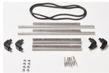
iM2306-BEZEL-LID Lid Bezel Kit