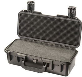
iM2306-X0001 With Foam