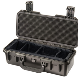
iM2306-X0002 With Padded Dividers