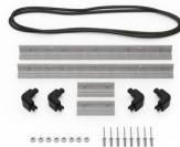
iM2306-BEZEL Base Bezel Kit