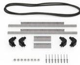
iM2306-BEZEL-LID Lid Bezel Kit