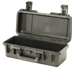
iM2306-X0000 No Foam