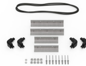
iM20XX-M4-BEZEL Base Bezel Kit (Metric)