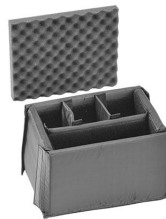
iM2075-DIV Padded Divider Set