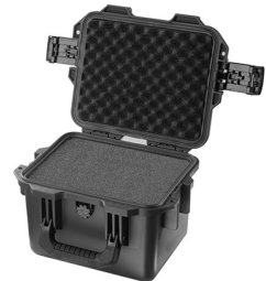
iM2075-X0001 With Foam