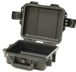
iM2050-X0000 No Foam