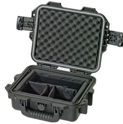
iM2050-X0002 With Padded Dividers