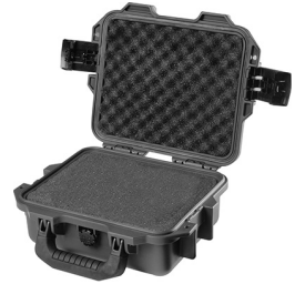
iM2050-X0001 With Foam