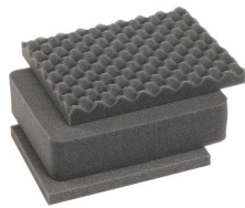
iM2050-FOAM 3 pc. Replacement Foam Set