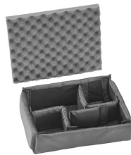
iM2050-DIV Padded Divider Set