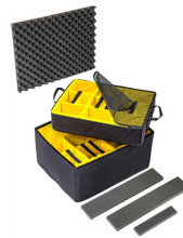
1637AirDS Padded Divider Set