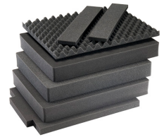
1637AirFS 7 pc. Replacement Foam Set