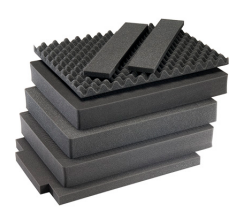
1637AirFS 7 pc. Replacement Foam Set