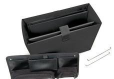
1436 Office Divider Kit