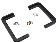
1430PF Special Application Panel Frame