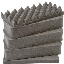
1431 5 pc. Replacement Foam Set