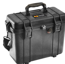
1430NF No Foam