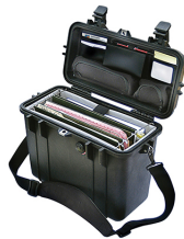
1437 With Padded Office Divider Set & Lid Organizer