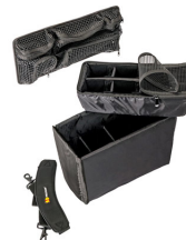
1435 Padded Divider Set