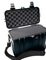
1430WF With Foam