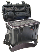
1434 With Padded Dividers & Lid Organizer