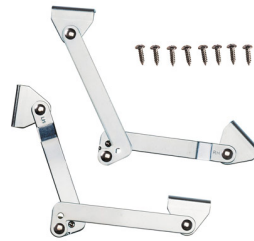
KIT-LIDSTAY-CARGO Cargo Lid Stays