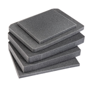
V200FS 4 pc. Replacement Foam Set