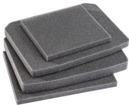
V100FS 4 pc. Replacement Foam Set