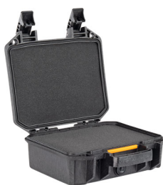
V100WF With Foam