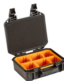
V100WD With Padded Dividers