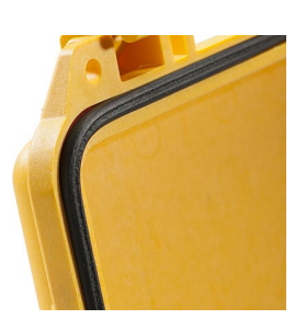
1783 Replacement O-ring