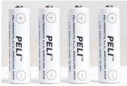
2469P Replacement Battery