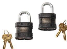
PL2 Cadenas (ensemble de 2)