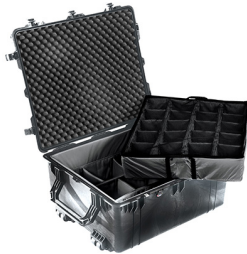
1694 With Padded Dividers