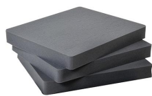
1692 Pick N Pluck™ Sections Only (set of 3)