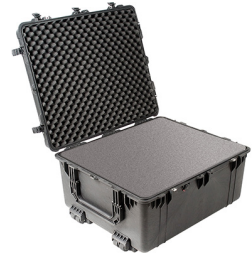
1690WF With Foam