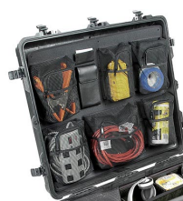
1699 Lid Organizer