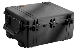
1690NF No Foam