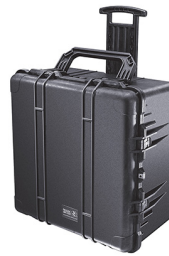
1640NF No Foam