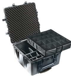
1644 With Padded Dividers