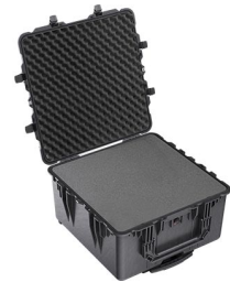
1640WF With Foam