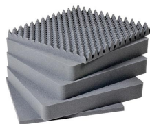
1641 5 pc. Replacement Foam Set