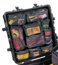
0379 Lid Organizer