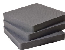
1642 Pick N Pluck™ Sections Only (set of 3)