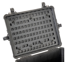
1610MP EZ-Click™ MOLLE Panel