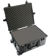
1610WF With Foam