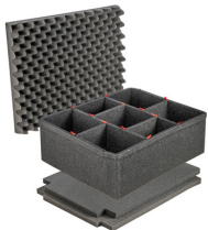
1610TPKIT TrekPak Case Divider Kit