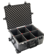
1610TP With TrekPak Divider System