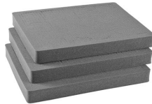
1612 Pick N Pluck™ Sections Only (set of 3)