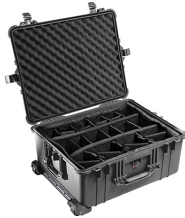
1614 With Padded Dividers