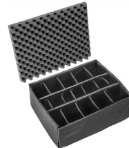
1615 Padded Divider Set