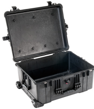
1610NF No Foam