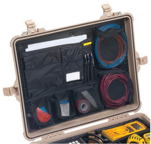
1609 Lid Organizer