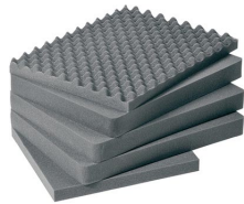
1611 5 pc. Replacement Foam Set