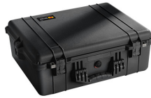
1600NF No Foam