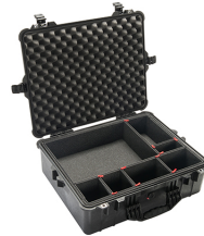
1600TP With TrekPak Divider System