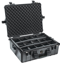
1604 With Padded Dividers