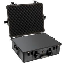
1600WF With Foam