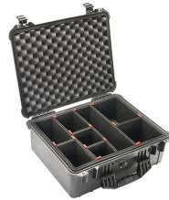
1550TP With TrekPak Divider System