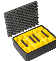
1555 Padded Divider Set