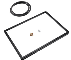
1550PF Special Application Panel Frame