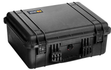
1550NF No Foam