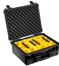
1554 With Padded Dividers