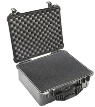
1550WF With Foam