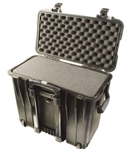
1440WF With Foam