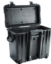
1440NF No Foam