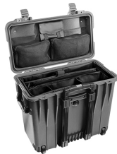
1447 With Padded Office Divider Set & Lid Organizer