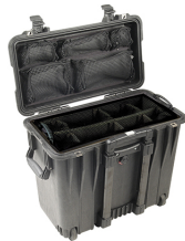
1444 With Utility Padded Divider Set & Lid Organizer