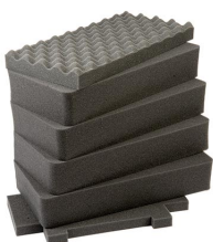
1441 6 pc. Replacement Foam Set