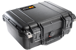
1400NF No Foam